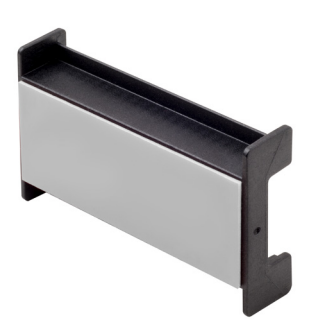
Self-adhesive tape mounting